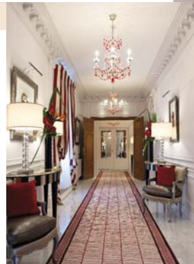
Luxury Junior Suites